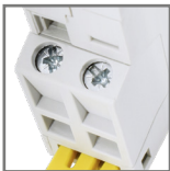
maximum terminal capacity 4 mm 2