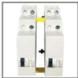
relay connection possible